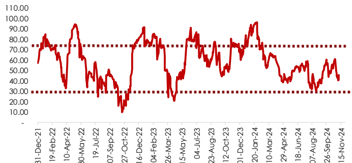
RSI of NGX All Share Index

Following the MPC's recent 25bps MPR tightening decision, we expect potential market gains to be moderated this week as investors take profits amid portfolio rebalancing.