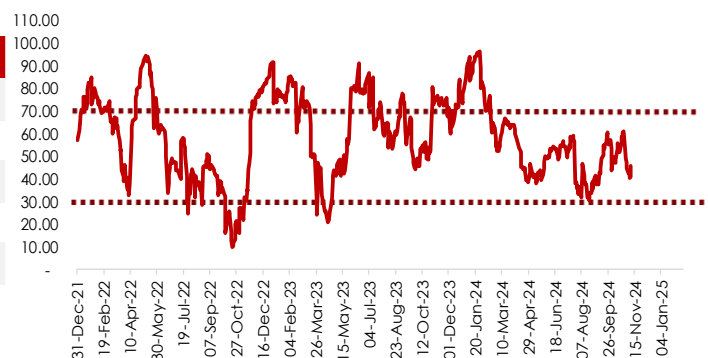
RSI of NGX All Share Index

This week, we expect a bullish run, supported by the earnings release.